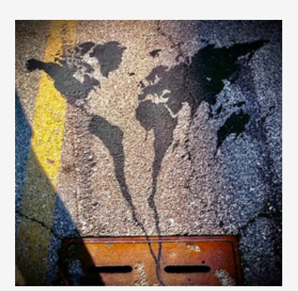
"Brooklyn's Wall" - 2021