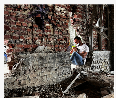
"The daily outdoor session" (5 songs) - Fall 2022