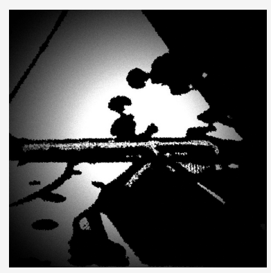
"ABC" - 2020